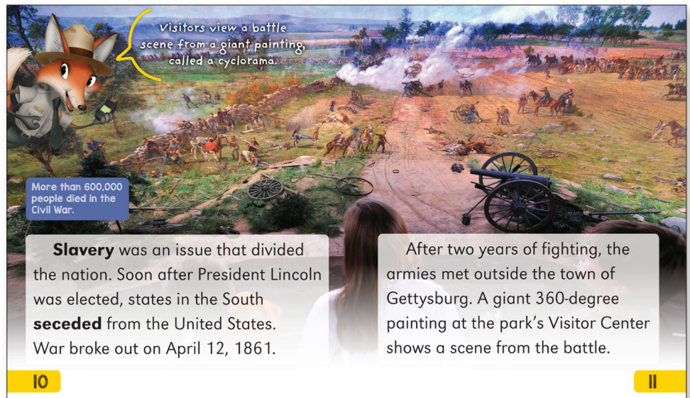
Sample spread from Gettysburg National Military Park